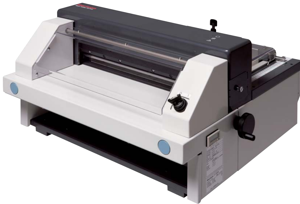
Table-top Paper Cutter for office efficiency and cost savings.